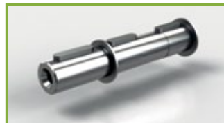
Single Output Shaft