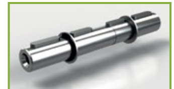
Double Output Shaft