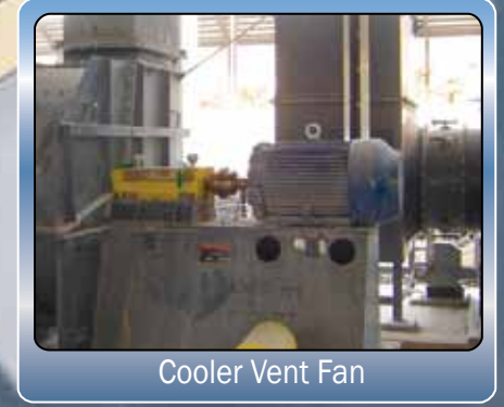
Cooler Vent Fan