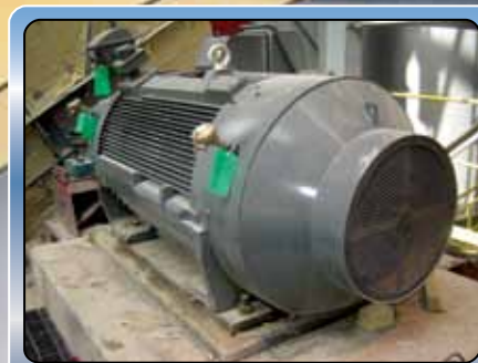
Baghouse ID Fan