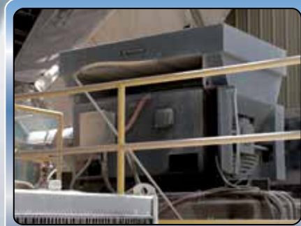
Preheater ID Fan