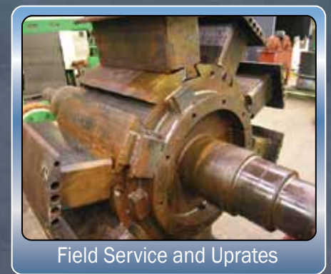
Field Service and Upgrades