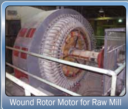
Wound Rotor Motor for Raw Mill

TECO-Westinghouse Motor Company has been a trusted brand for over 100 years. Although our processes have been refined, we remain committed to producing rugged and reliable products for the most demanding needs in the cement industry. Custom engineered induction squirrel cage, wound rotor, and synchronous motors, a wide variety of stock motors and low voltage drives, motor control centers, genuine Westinghouse renewal parts, and motor repair services are the foundation upon which you can build an industry.