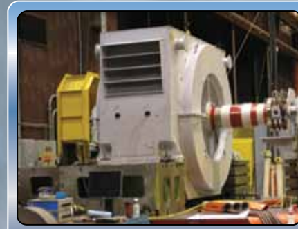
Synchronous Motor for Finish Mill