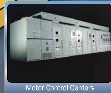
Motor Control Centers